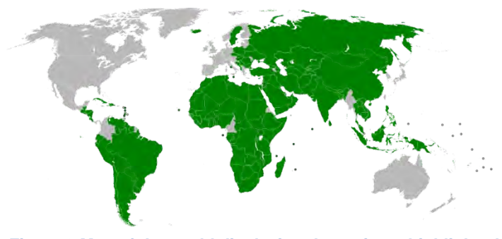
Figure 3 Map of the world displaying the nations, highlighted in green, supporting the State of Palestine, and the nations highlighted in grey, condemning the State of Palestine and largely supporting Israel

Palestine in itself, and therefore refuse to support the creation of a Palestinian state. Ultimately, this results into a form of political polarization, in which the majority of the nations do support the State of Palestine, but are silenced by the few other, but powerful, nations that oppose the State of Palestine and side with the Israeli government and its beliefs on the matter.