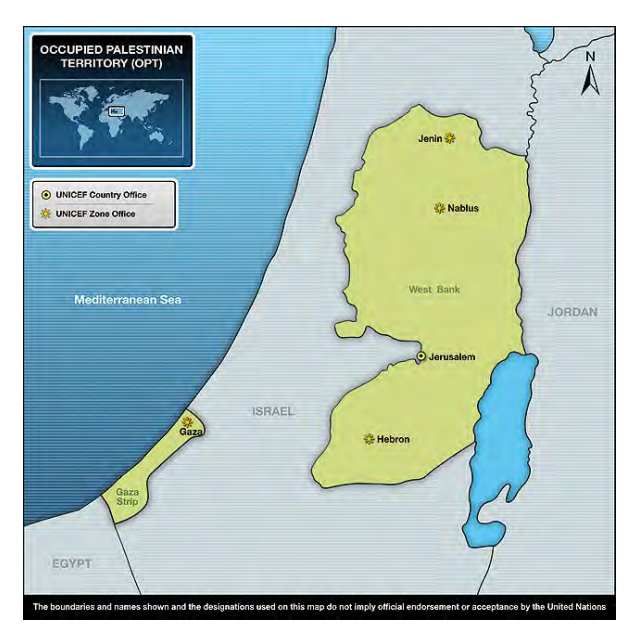
Figure 2 Map displaying the current territory occupied by Palestinian authorities

The Palestine Liberation Organization was founded in 1963 with the purpose of liberating Palestinian authorities from Israeli armed forces. It is the governing body of the State of Palestine. It consists of several factions, like the ones previously mentioned, that promote Palestinian nationalism amongst Palestinian citizens. By many nations, including Israel, the authority is regarded as the main representative of the Palestinian citizens and has been granted the right of non-member observer state within the UN. Before 1991, the organization was consider to be a terrorist organization by the US for having allegedly been corrupt and having made use of violent force upon Israel. Even though the issue of corruption within