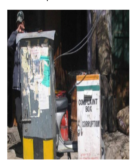
A complaint box for corruption placed in India

At the base of all anti-corruption measures is a judicial, law, system which is corrupt. If the judicial system is corrupt then the fundamental human right of having a fair trial is broken. Having corrupt officials convicted by the local judicial system is also important but having a corrupt judicial system will make sure that will never happen. There has been much progress on this especially in the Convention Against Corruption because it is seen as a base to all corruption issues.