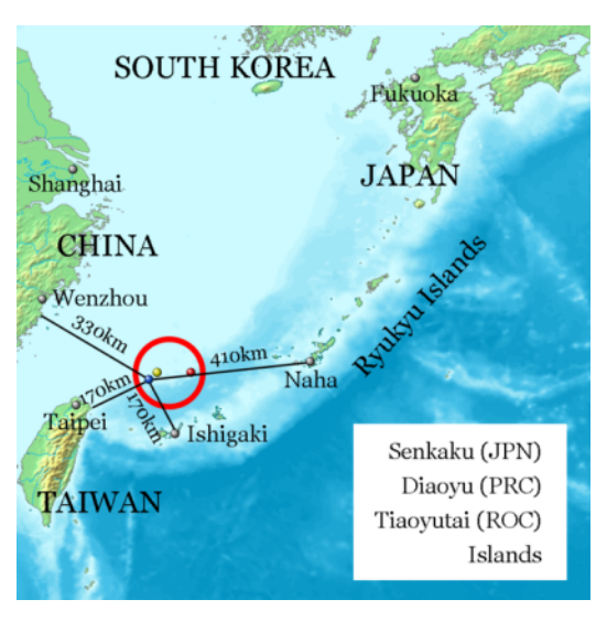
Relative distance of the islands to the nearest point of the claiming states

As mentioned, the Senkaku/Diaoyu Islands, or any island at that, are a great opportunity for any country to lay claim to many natural resources in the region. Why are the Senkaku/Diaoyu Islands so Sea? important in the South China The Senkaku/Diaoyu Islands lie close to very large oil reserves that can be claimed if one of the states actually has sovereignty over the islands. This is what makes these islands so attractive for claims. The islands also lie very far from the states claiming them. This is relevant, since this means that the