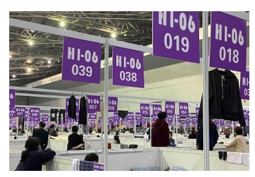
Isolation facility in Shanghai

strict in preserving the measures that were and are taken. For example China, this is where the virus was first discovered and spread from a bat to a human (although this is still not one hundred percent sure), civil rights during the pandemic were extremely limited. Infected citizens were and still are in some locations isolated in special facilities, such as in Shanghai. The conditions are terrible with