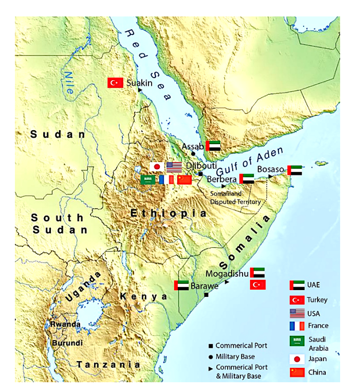
Figure SEQ Figure )* ARABIC 1. Young, Karen E. "UAE and the Horn of Africa: A Tale of Two Ports" Arab Gulf States Institute in Washington, 30 Aug. 2018, https://agsiw.org/uae-horn-africa-tale-two-ports/

Djibouti is strategically located by the Bab-el-Mandeb Strait, separating Gulf of Aden from the Red Sea, controlling incomers to the Suez Canal. From this geopolitically favorable position, this attracts many FMBs, including Chinese naval bases, Italian support bases, French airbases, and US logistics hubs (Figure. 1). The Horn of Africa links Africa, Middle East and serves as opening towards Europe via the Suez Canal to the Red Sea; an interest for global markets, as it is seen as a main passageway for oil trading from the Gulf to reach North America, and is the shortest commercial route to EU member states. Horn of Africa has experienced substantial increase in foreign military bases since 2001, especially after the