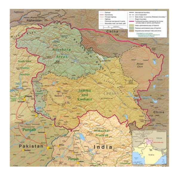
Figure 3. Map of the Kashmir region

Figure 3 and are: The Northern Areas (green), Jammu and Kashmir (yellow), Aksai Chin (light brown) and two northern parts of the Kashmir region. One of these two parts is official part of China (dark brown), and the other part was ceded to China by Pakistan in 1963 (dark brown with stripes). This part is known as the Trans-Karakoram Tract. The Northern Areas are administered by Pakistan, Jammu and Kashmir are controlled by India, and Aksai Chin and the Trans-Karakoram Tract are entirely administered by China.