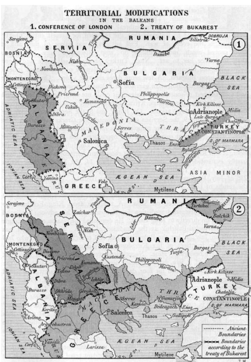
Borders of the Balkan states after the Treaty of London<sup>12</sup>

After the fall of the Ottoman empire in the region, Albania declared independence. The treaty of London divided the Balkan as seen depicted in the illustration below, the Ottomans had lost significant territory. The treaty was signed on the 30<sup>th</sup> of May 1913 and uniformly concluded the Balkan War on the 10<sup>th</sup> of August 1913<sup>11</sup>.