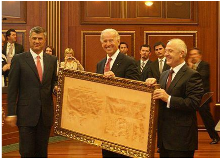
The former president of Kosovo, Hashim Thaçi, and former vice-president of the US Joe Biden holding Kosovo's declaration of independence<sup>16</sup>

Kosovo has been mentioned a few times before in this report and it has been disclaimed that not all countries actually recognize Kosovo as an independent state. Serbia (obviously), China, and Russia are the three most important UN member states that have not recognized Kosovo after the 2008 Kosovo Declaration of independence.