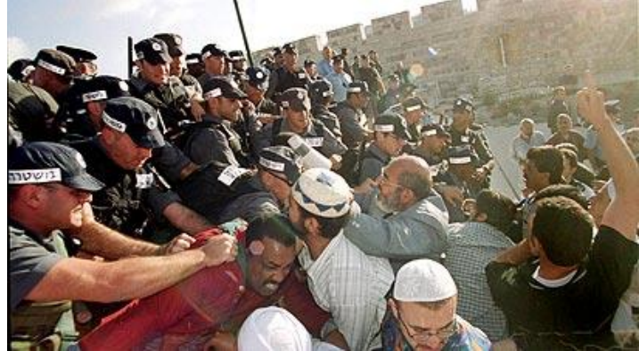
Figure 3: Battle of Gaza

The latest major battle, regarding the Palestinian - Israeli conflict, was the Battle of Gaza in 2007 where The Hamas took over the Gaza strip. This battle was between Hamas and Fatah, formerly the Palestinian National Liberation Movement. Fatah had recently lost the parliamentary elections in 2006 and hence the conflict involved the struggle of gaining power. Hamas were removed from the Gaza stirp and the West Bank was split into two.